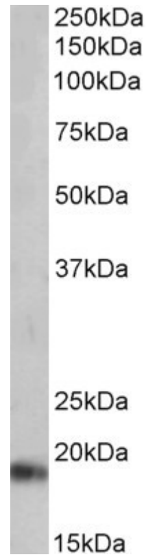
EB11166 (0.01µg/ml) staining of Mouse Heart lysate (35µg protein in RIPA buffer). Primary incubation was 1 hour. Detected by chemiluminescence.