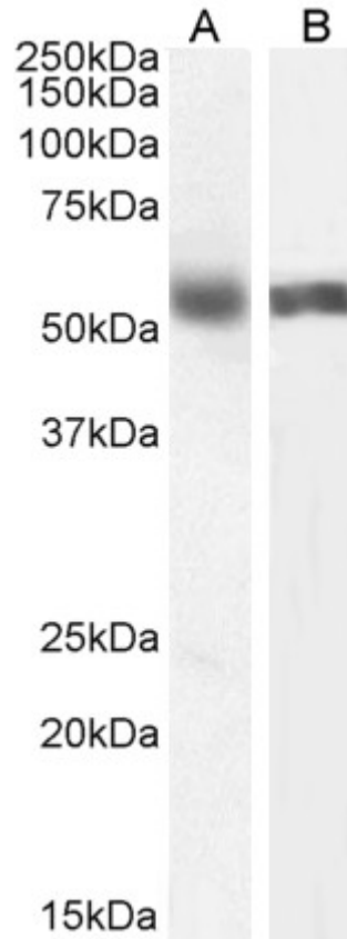
EB11171 (0.5µg/ml) staining of Human Liver (A) and (1µg/ml) Lung (B) lysate (35µg protein in RIPA buffer). Detected by chemiluminescence.