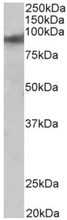
EB11188 (0.01µg/ml) staining of Human Heart lysate (35µg protein in RIPA buffer). Detected by chemiluminescence.