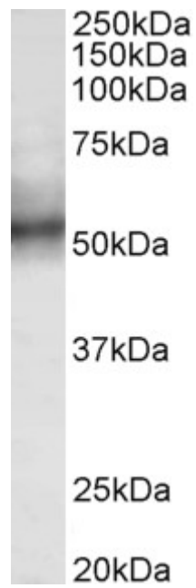
EB11287 (0.3 \mu g/ml) staining of Human Spleen lysate (35 \mu g protein in RIPA buffer). Detected by chemiluminescence.