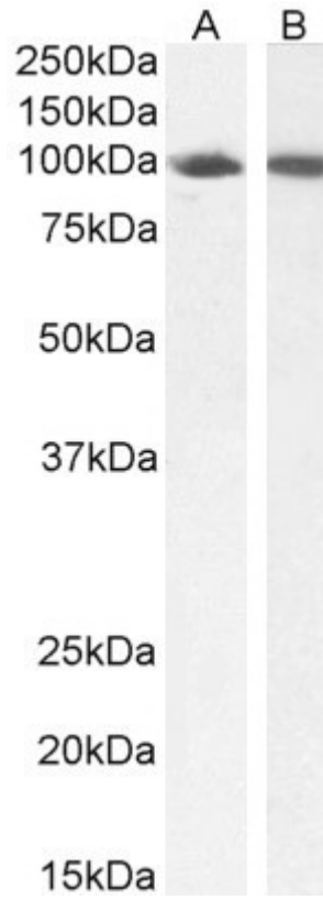
EB11392 (0.5 \mu g/ml) staining of K562 (A) and (0.3 \mu g/ml) NIH3T3 (B) cell lysate (35 \mu g protein in RIPA buffer).. Detected by chemiluminescence.