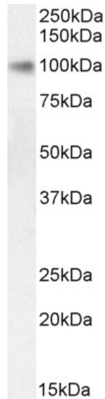
EB11392 (0.5 \mu g/ml) staining of Mouse Lymph node lysate (35 \mu g protein in RIPA buffer).. Detected by chemiluminescence.