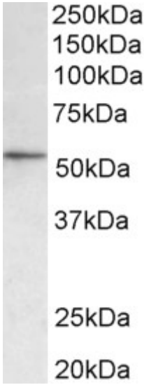
EB11428 (0.3µg/ml) staining of NIH3T3 lysate (35µg protein in RIPA buffer). Primary incubation was 1 hour. Detected by chemiluminescence.