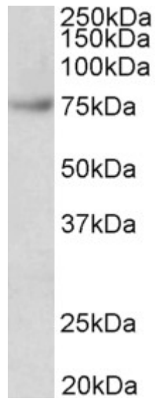
EB11620 (0.03 \mu g/ml) staining of Jurkat lysate (35 \mu g protein in RIPA buffer). Primary incubation was 1 hour. Detected by chemiluminescence.