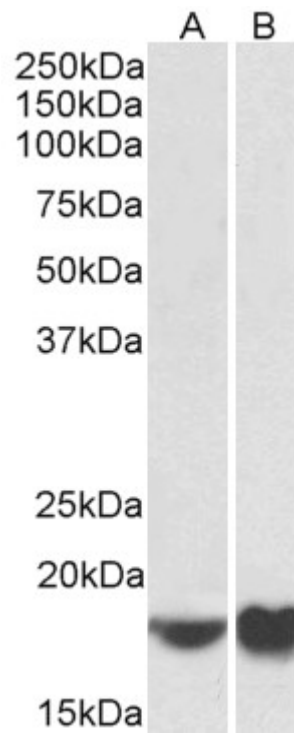
EB11622 (0.5 \mu g/ml) staining of NIH3T3 (A) and HeLa (B) lysates (35 \mu g protein in RIPA buffer). Detected by chemiluminescence.