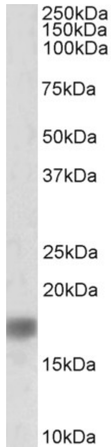
EB11714 (0.1µg/ml) staining of Human Amygdala lysate (35µg protein in RIPA buffer). Detected by chemiluminescence.