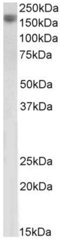
EB11752 (1 \mu g/ml) staining of Human Prostate lysate (35 \mu g protein in RIPA buffer). Detected by chemiluminescence.