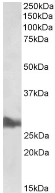
EB11963 (0.5µg/ml) staining of Liver lysate (35µg protein in RIPA buffer). Detected by chemiluminescence.