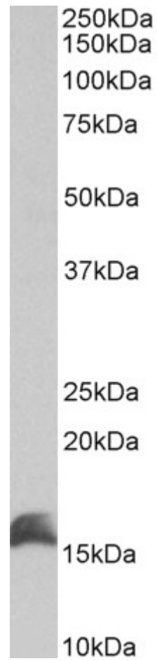
EB12230 (1 \mu g/ml) staining of Kelly lysate (35 \mu g protein in RIPA buffer). Detected by chemiluminescence.