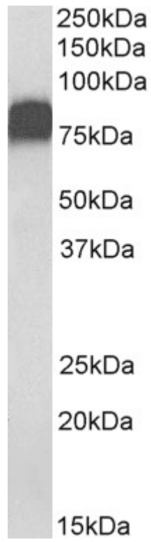
E12255 (0.03 \mu g/ml) staining of U-2 OS lysate (35 \mu g protein in RIPA buffer). Primary incubation was 1 hour. Detected by chemiluminescence.