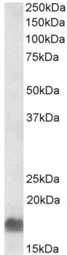
EB12263 (0.3 \mu g/ml) staining of A549 lysate (35 \mu g protein in RIPA buffer). Primary incubation was 1 hour. Detected by chemiluminescence.