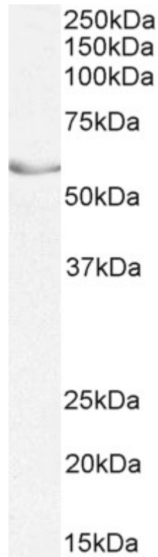
EB12283 (0.3 \mu g/ml) staining of Pig Ovary lysate (35 \mu g protein in RIPA buffer). Detected by chemiluminescence.