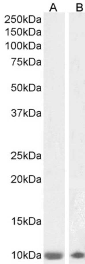
EB12316 (1µg/ml) staining of Human Olfactory Bulb (A) and Cerebellum (B) lysates (35µg protein in RIPA buffer). Primary incubation was 1 hour. Detected by chemiluminescence.