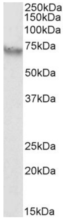
EB12346 (0.3µg/ml) staining of HepG2 lysate (35µg protein in RIPA buffer). Primary incubation was 1 hour. Detected by chemiluminescence.