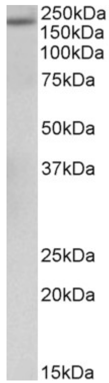
EB12365 (0.5 \mu g/ml) staining of Human Albumin-depleted Serum lysate (35 \mu g protein in RIPA buffer). Detected by chemiluminescence.