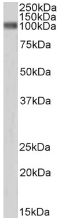
EB12543 (0.3µg/ml) staining of HeLa lysate (35µg protein in RIPA buffer). Detected by chemiluminescence.