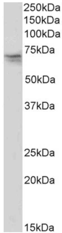
EB12563 (0.03 \mu g/ml) staining of K562 nuclear lysate (35 \mu g protein in RIPA buffer). Detected by chemiluminescence.