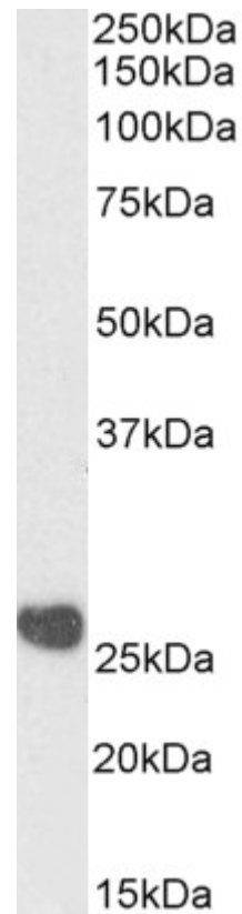
EB12709 (0.3 \mu g/ml) staining of Pig Testis lysate (35 \mu g protein in RIPA buffer). Primary incubation was 1 hour. Detected by chemiluminescence