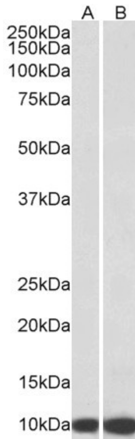
EB12836 (0.3 \mu g/ml) staining of HeLa (A) and HepG2 (B) lysates (35 \mu g protein in RIPA buffer). Primary incubation was 1 hour. Detected by chemiluminescence.