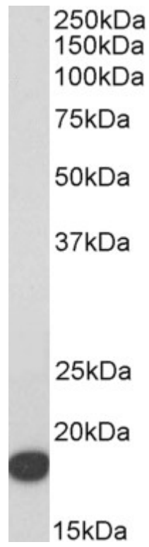
EB12863 (1 \mu g/ml) staining of HeLa lysate (35 \mu g protein in RIPA buffer). Detected by chemiluminescence.