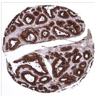
GTX04365 IHC-P Image

IHC-P analysis of human follicular thyroid cancer tissue section using GTX04365 Thyroglobulin antibody [MSVA-189R] HistoMAX™. Follicular thyroid cancer with strong thyroglobulin expression.