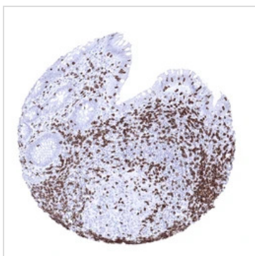
GTX04389 IHC-P Image

IHC-P analysis of human squamous cell carcinoma tissue section using GTX04389 CD3 epsilon antibody [MSVA-003R] HistoMAX™. Squamous cell carcinoma containing numerous CD3 epsilon positive T lymphocytes.