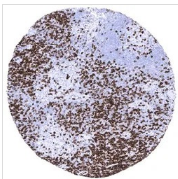
GTX04390 IHC-P Image

IHC-P analysis of human lung tissue section using GTX04390 CD7 antibody [MSVA-007R] HistoMAX™. Strong membranous CD7 expression of an adenocarcinoma of the lung.