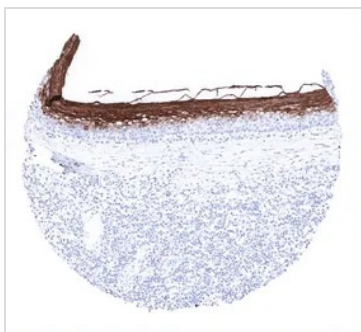
GTX04399 IHC-P Image

IHC-P analysis of human colon tissue section using GTX04399 CD66e antibody [MSVA-465R] HistoMAX™. Moderate to strong CD66e immunostaining in the epithelial cells of the colon. Inflammatory and smooth muscle cells remain negative.