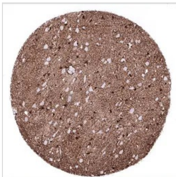
GTX04404 IHC-P Image

IHC-P analysis of human brain cerebrum grey tissue section using GTX04404 S100 beta antibody [MSVA-490R] HistoMAX™.