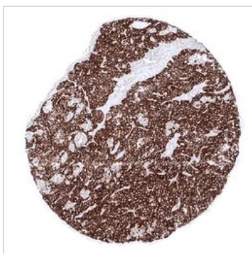
GTX04405 IHC-P Image

IHC-P analysis of human parathyroid gland tissue section using GTX04405 Parathyroid Hormone antibody [MSVA-525R] HistoMAX™. Strong cytoplasmic Parathyroid Hormone immunostaining of all cells of a parathyroid gland.