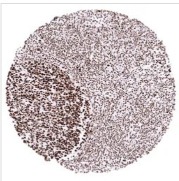
GTX04408 IHC-P Image

IHC-P analysis of human colorectal adenocarcinoma tissue section using GTX04408 MSH2 antibody [MSVA-902M] HistoMAX™.