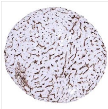
GTX04429 IHC-P Image

IHC-P analysis of human liver tissue section using GTX04429 HLA-DRA antibody [MSVA-470R] HistoMAX™.