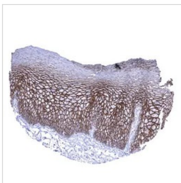
GTX04468 IHC-P Image

IHC-P analysis of human penis tissue section using GTX04468 Desmoglein 3 antibody [MSVA-543M] HistoMAX™. Squamous cell carcinoma of the penis with intense membranous Dsg3 immunostaining of tumor cells.