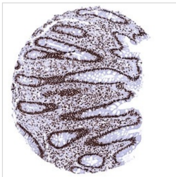
GTX04480 IHC-P Image

IHC-P analysis of human appendix mucosa tissue section using GTX04480 Ku80 antibody [MSVA-880M] HistoMAX™.