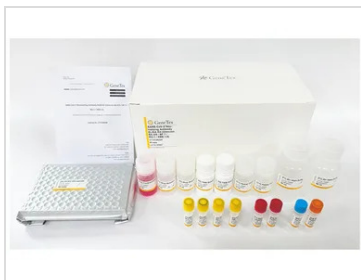
GTX538288 Neutralizing/Inhibition Image