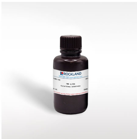
Bottle TMB ELISA Peroxidase Substrate