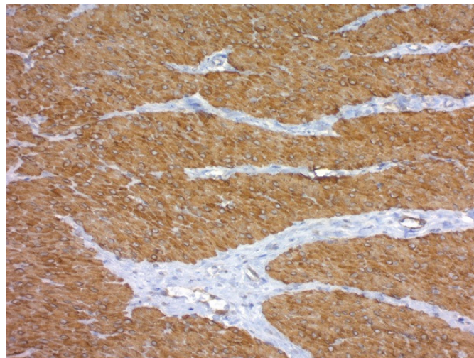
Uterus stained using Actin, \alpha -Smooth Muscle; Clone 1A4. No pretreatment with HIER Solution, PolyTek Anti-Mouse Polymerized HRP and DAB Chromogen/Substrate (High Contrast). Counterstained with Hematoxylin, Mayer's (Lillie's Modification). Final magnification 200X.