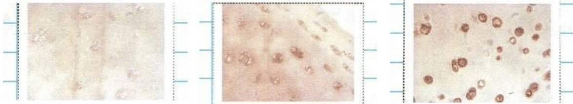
Immunocytochemistry/Immunofluorescence analysis using Mouse Anti-SOD3 Monoclonal Antibody, Clone 4GG11G6 (SMC-167). Tissue: cartilage. Species: Human. Primary Antibody: Mouse Anti-SOD3 Monoclonal Antibody (SMC-167) at 1:1000.