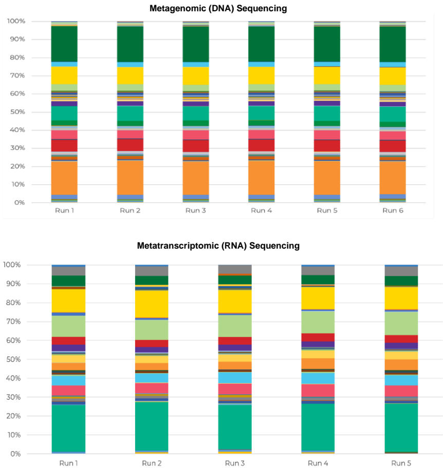
Figure 1: Stability and consistency of taxonomy profiles at the genus-level of the ZymoBIOMICS™ Fecal Reference with TruMatrix™ Technology across different runs of metagenomic and metatranscriptomic sequencing. Workflow description, downloadable raw data, and bioinformatics analyses can be found in Appendix A.